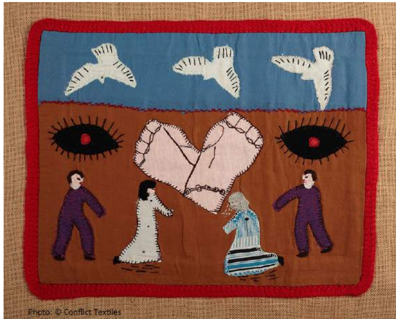
'¿Dónde están nuestros hijos? / Where are our children?', Chilean arpillera, 1979, Anonymous.

30 August 2024 International Day of the Disappeared